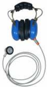
E-Scope EMS Electronic Stethoscope

EMS - paramedic? The E-Scope EMS provides exceptional sound quality in a very high noise area.