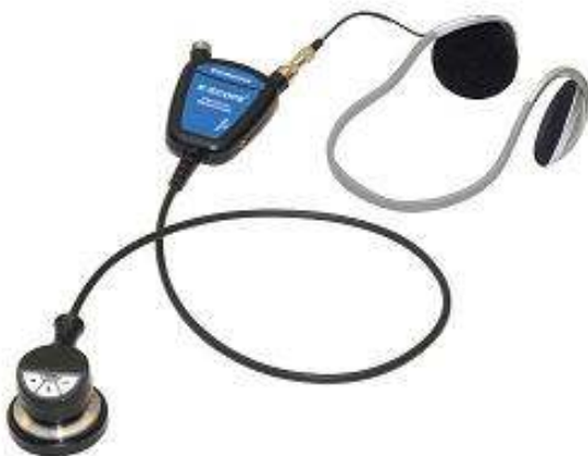
E-Scope Hearing Impaired Model for ITE hearing aids