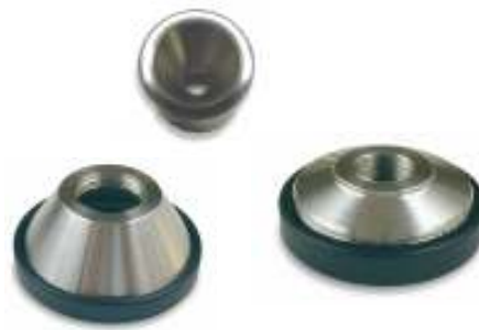
The 'Specialist' Heads Pediatric Bell, Adult Bell, Adult Diaphragm

For more information, uses and updates visit us at www.dudleymedical.com , or call us at 800-879-9635